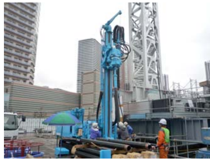
Geothermal hole drilling