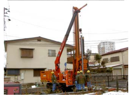
Water well drilling