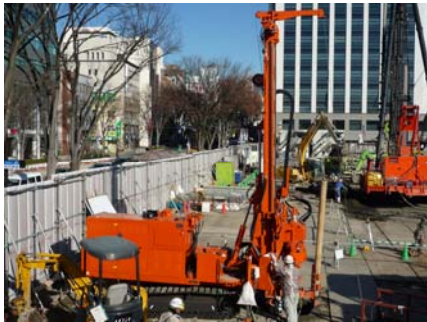
Geothermal hole drilling